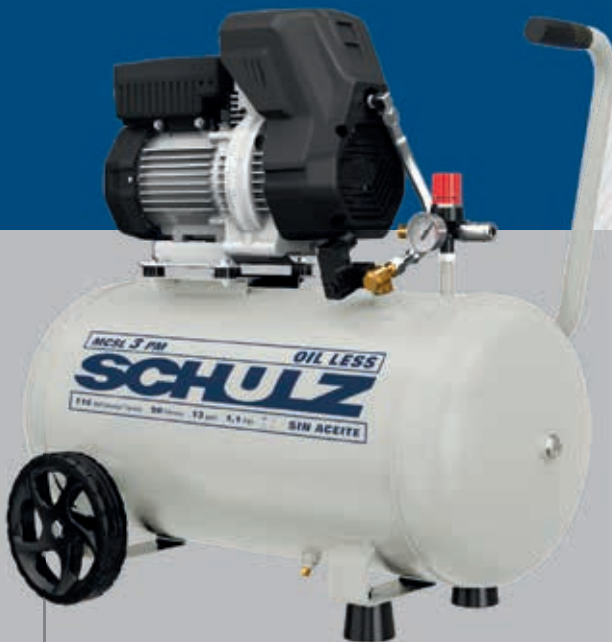
MCSL 3/50 PM