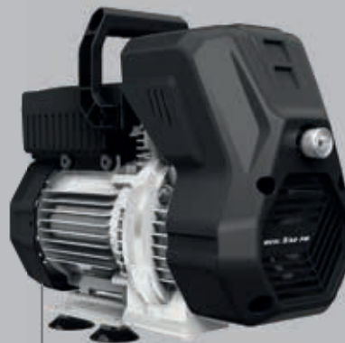
MCSL 3/AD PM